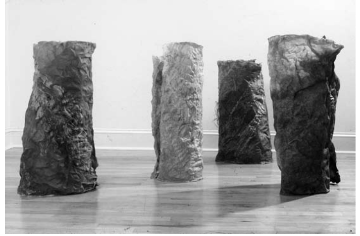
Two works by Bilge Friedlander created in collaboration with Helmut Becker at FlaxHemp PaperWorks & Press, Ontario, Canada. LEFT: Detail of Tree Bandages, June 1988, 24 inch wide x 8 feet long each, an outdoor site-specific installation of handmade bleached flax/linen scrolls wrapped around trees in a public park in Philadelphia. RIGHT: Cedar Forest, 1989, 48 x 30 x 16 inches each, handmade scrolls of flax/linen handmade paper, exhibited in the 1989 International Istanbul Biennial.

then in zip code order. All respondents completed the questionnaire in English, so we can assume that all of the studios on the list are comfortable communicating in English.