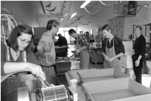
Paper Circle in Nelsonville, Ohio, is a 2,400 square foot, fully equipped papermaking studio offering studio rental, technical assistance, residencies, pulp preparation, workshops, and internships. Photo: Molly Schoenhoff, February 2008. Courtesy of Paper Circle .