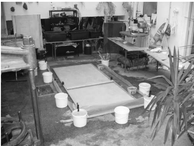
The yard of the PapierWespe Studio in downtown Vienna (Beatrix Mapalagama, proprietor) with a 1.3 x 3 meter sheet of mulberry paper draining on the mould. The studio offers studio rental with technical assistance, pulp preparation, workshops, and exhibitions.